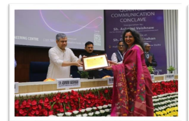
M/s Vihaan Networks Limited, Gurugram