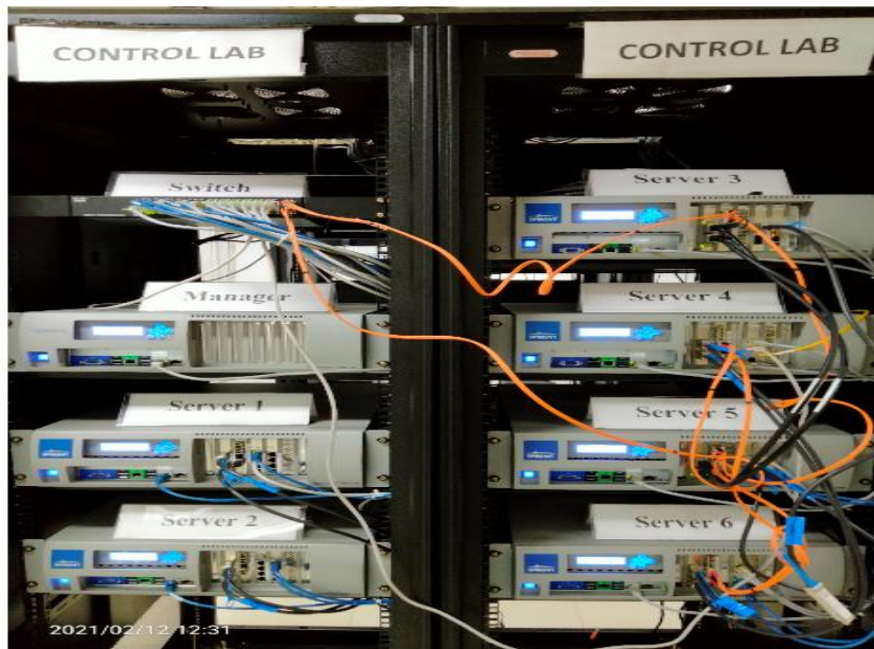
Fig 1: Control Lab Set-up